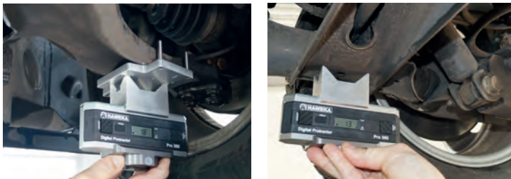
Application examples (measuring adapter ③ and crown adapter ①)