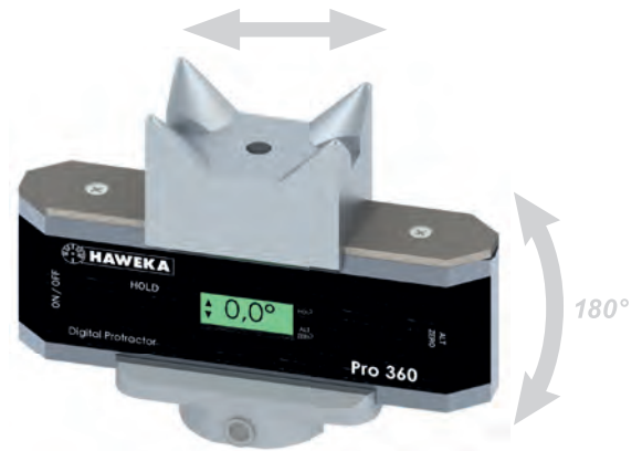
The crown adapter can be moved laterally. Double-sided application area, 2 position adapters available (rotatable by 180°).

The device enables measurement of the inclination angle of the transverse control arm or the drive shaft to the horizontal. The measured values can be used as further input in electronic axle alignment systems and are important for correct setting of the camber, toe and castor.