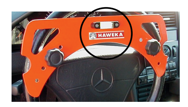
The adjustable tap on the spirit level is used on virtually all cars and light trucks.