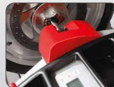
The wheel suspension on the BikeBoss is also suitable for small scooter wheels from 12" to large 21" enduro wheels.