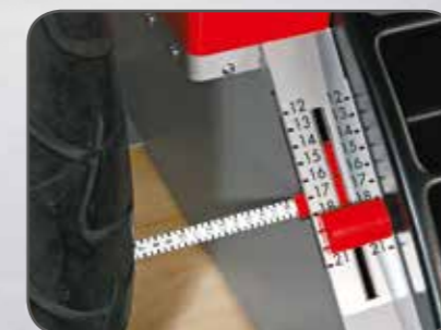
Exact positioning and precise weight placement with measuring tape.